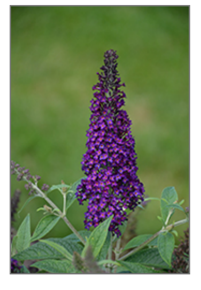
Monarch Dark Dynasty Butterfly Bush flowers

Monarch Dark Dynasty Butterfly Bush is a multi-stemmed deciduous shrub with a more or less rounded form. Its average texture blends into the landscape, but can be balanced by one or two finer or coarser trees or shrubs for an effective composition.