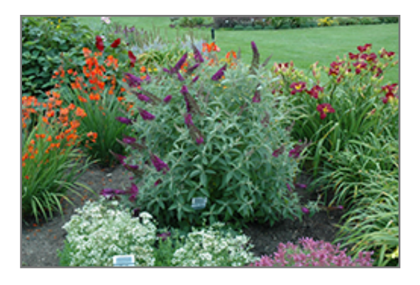
Monarch Dark Dynasty Butterfly Bush in bloom

This is a relatively low maintenance shrub, and is best pruned in late winter once the threat of extreme cold has passed. It is a good choice for attracting bees, butterflies and hummingbirds to your yard, but is not particularly attractive to deer who tend to leave it alone in favor of tastier treats. It has no significant negative characteristics.