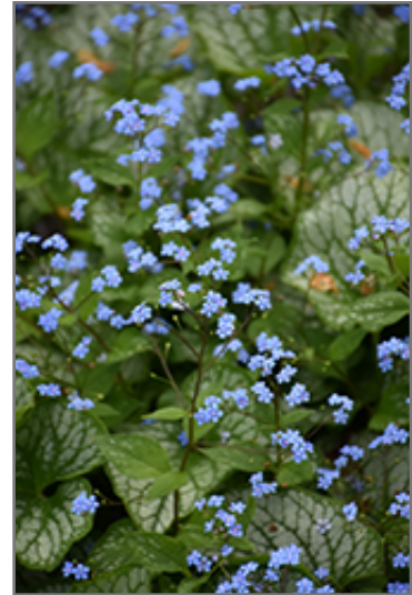
Sea Heart Bugloss flowers

Sea Heart Bugloss is recommended for the following landscape applications;