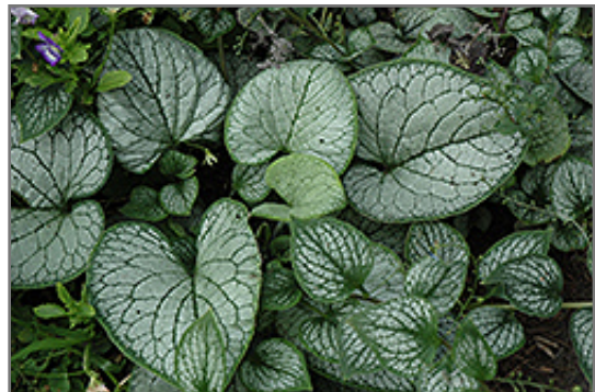
Sea Heart Bugloss foliage