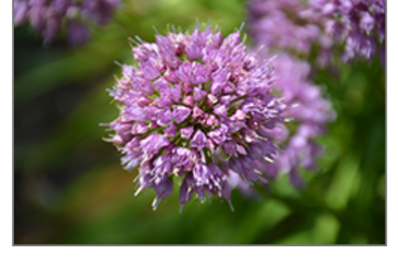
Millenium Ornamental Onion flowers

Millenium Ornamental Onion will grow to be about 12 inches tall at maturity extending to 20 inches tall with the flowers, with a spread of 15 inches. It grows at a medium rate, and under ideal conditions can be expected to live for approximately 5 years. As an herbaceous perennial, this plant will usually die back to the crown each winter, and will regrow from the base each spring. Be careful not to disturb the crown in late winter when it may not be readily seen! As this plant tends to go dormant in summer, it is best interplanted with late-season bloomers to hide the dying foliage.