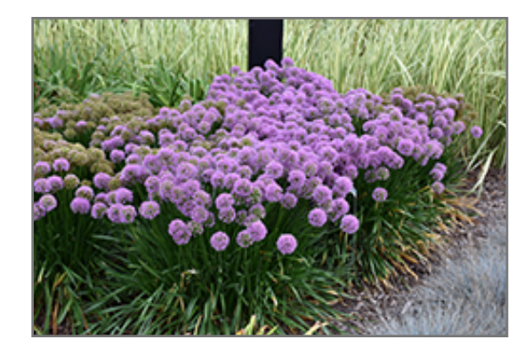
Millenium Ornamental Onion in bloom