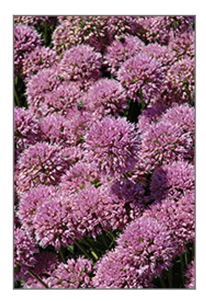
Millenium Ornamental Onion flowers

Millenium Ornamental Onion is an open herbaceous perennial with tall flower stalks held atop a low mound of foliage. Its relatively coarse texture can be used to stand it apart from other garden plants with finer foliage.