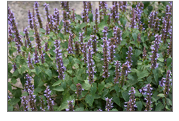
Little Adder Hyssop flowers