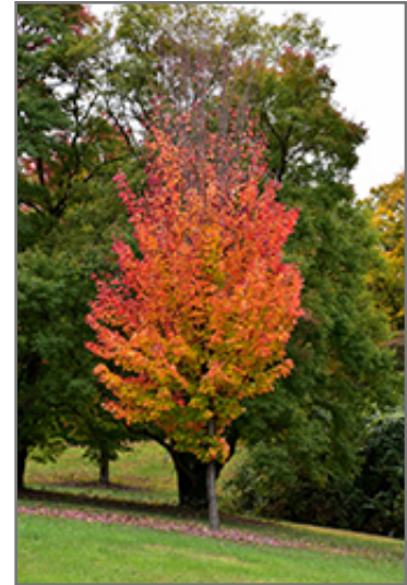
Red Rocket Red Maple in fall

This is a relatively low maintenance tree, and should only be pruned in summer after the leaves have fully developed, as it may 'bleed' sap if pruned in late winter or early spring. It has no significant negative characteristics.