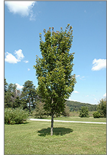
Red Rocket Red Maple

This tree should only be grown in full sunlight. It is quite adaptable, preferring to grow in average to wet conditions, and will even tolerate some standing water. It is not particular as to soil type, but has a definite preference for acidic soils, and is subject to chlorosis (yellowing) of the foliage in alkaline soils. It is somewhat tolerant of urban pollution. This is a selection of a native North American species.