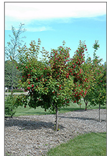
Ruby Slippers Amur Maple