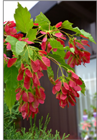
Ruby Slippers Amur Maple fruit