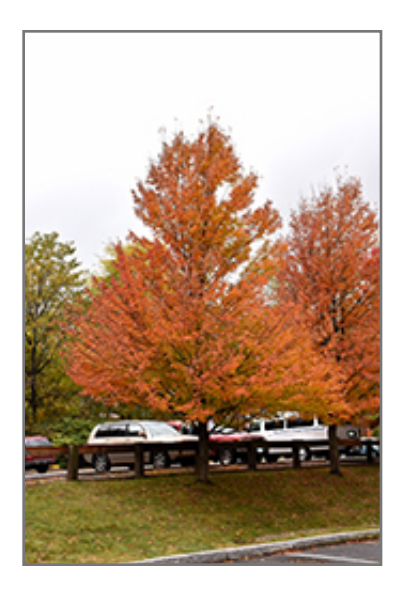
Karpick Red Maple in fall