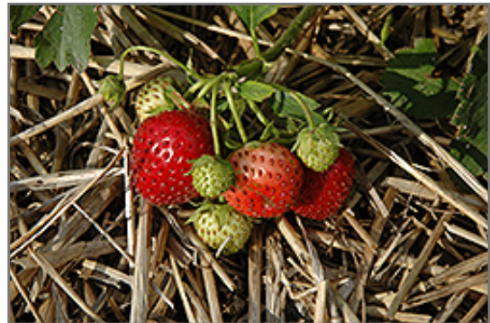
Evangeline Strawberry fruit

This is an open herbaceous perennial with a spreading, ground-hugging habit of growth. Its relatively fine texture sets it apart from other garden plants with less refined foliage. This is a high maintenance plant that will require regular care and upkeep, and should not require much pruning, except when necessary, such as to remove dieback. It is a good choice for attracting birds to your yard, but is not particularly attractive to deer who tend to leave it alone in favor of tastier treats. Gardeners should be aware of the following characteristic(s) that may warrant special consideration;