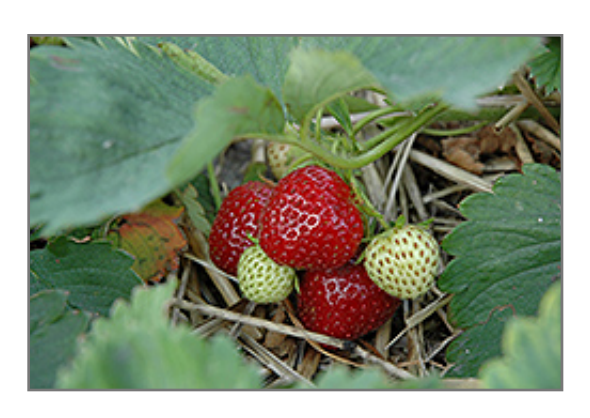
Elvira Strawberry fruit

This popular variety is early, with a high yield of large, juicy red berries in late spring and early summer; vigorous, winter hardy, and shows good disease resistance