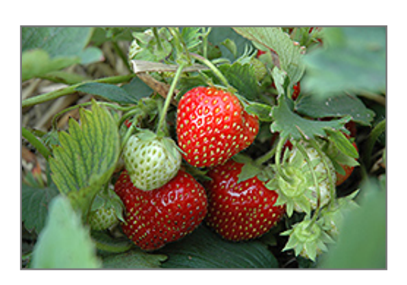
Brunswick Strawberry fruit

This variety produces early to mid-season, high quality berries that maintain a more uniform size; vigorous, winter hardy, and shows excellent disease resistance