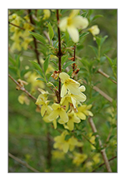
Weeping Forsythia flowers