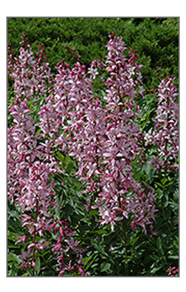
Rubra Gas Plant flowers

This variety produces stunning hot pink and white flower spikes in early summer above rich green foliage; blooms one year after planting and is slow to reach maturity; impressive when massed in the garden and worth the wait