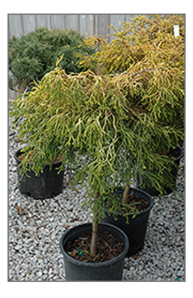
Lemon Twist Hinoki Falsecypress (tree form)

Lemon Twist Hinoki Falsecypress (tree form) is a dwarf conifer which is primarily valued in the landscape or garden for its highly ornamental weeping form. It has attractive gold-variegated yellow foliage. The twisted scale-like sprays of foliage are highly ornamental and remain yellow throughout the winter.