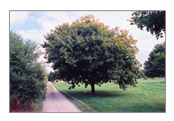
Black Maple

This is a close relative of the sugar maple, sharing the attributes of good yellow to orange fall color and a shapely habit of growth, and is even a little more adaptable to tougher growing conditions; a noble shade tree worth seeking out