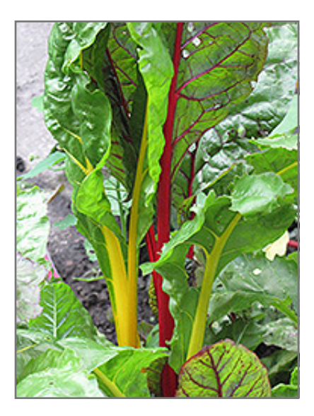
Bright Lights Swiss Chard foliage

Bright Lights Swiss Chard will grow to be about 24 inches tall at maturity, with a spread of 18 inches. This fast-growing vegetable plant is an annual, which means that it will grow for one season in your garden and then die after producing a crop. Because of its relatively short time to maturity, it lends itself to a series of successive plantings each staggered by a week or two; this will prolong the effective harvest period.