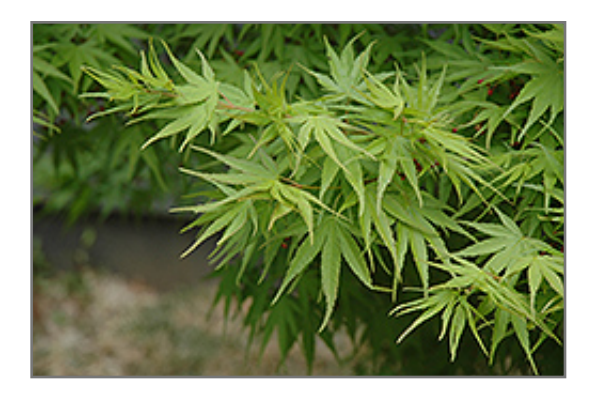
Ibo Nishiki Japanese Maple foliage