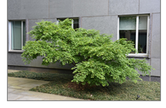
Ibo Nishiki Japanese Maple

Ibo Nishiki Japanese Maple is primarily valued in the landscape for its ornamental globe-shaped form. It has attractive green deciduous foliage. The small lobed palmate leaves are highly ornamental and turn outstanding shades of yellow, orange and red in the fall. The warty brown bark is extremely showy and adds significant winter interest.