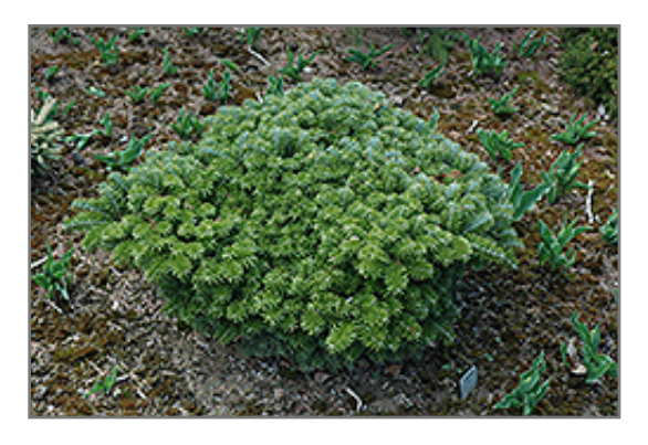
Tundra Korean Fir

A beautiful, slow growing dwarf variety that has a dense, mounded habit; flat, deep green needles have white undersides; showy white buds crown the branches in late fall and winter; ideal for a rock garden, particular as to siting