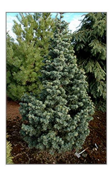
Compact White Fir

The Compact White Fir will grow to be about 8 feet tall at maturity, with a spread of 6 feet. It tends to fill out right to the ground and therefore doesn't necessarily require facer plants in front, and is suitable for planting under power lines. It grows at a slow rate, and under ideal conditions can be expected to live for 80 years or more.