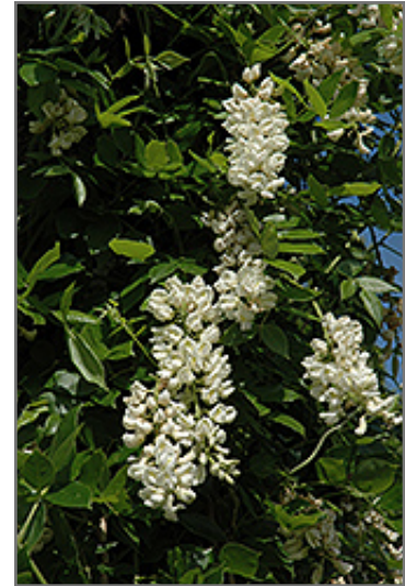
Ivory Tower Wisteria flowers