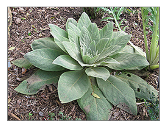
Arctic Summer Turkish Mullein

Arctic Summer Turkish Mullein is recommended for the following landscape applications;