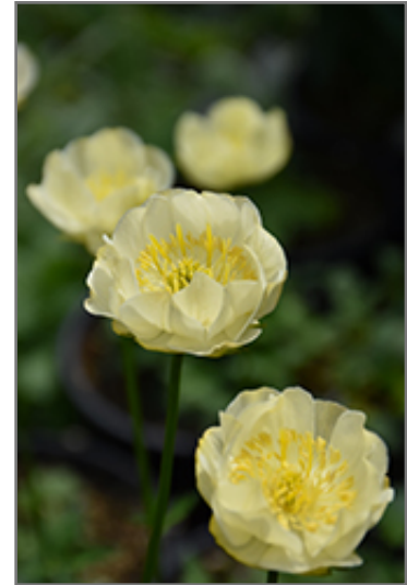
New Moon Globeflower flowers