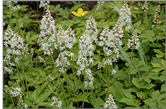
Eco Spotted Velvet Foamflower flowers