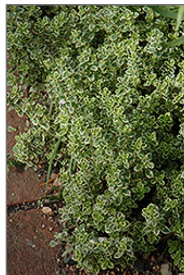
Aureus Lemon Thyme foliage