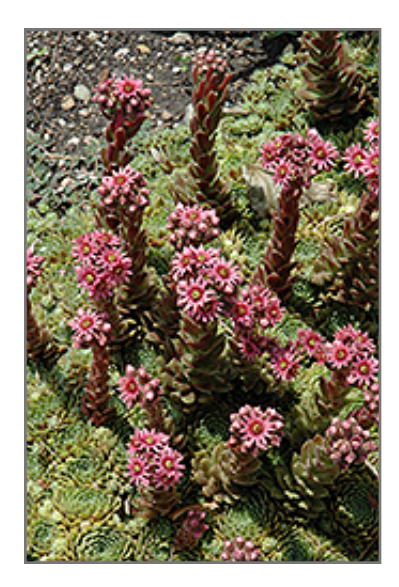
Pilioseum Hens And Chicks flowers