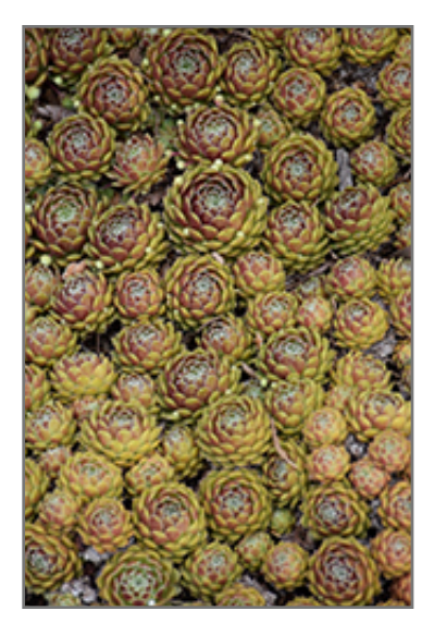
Pilioseum Hens And Chicks

This plant will require occasional maintenance and upkeep, and should not require much pruning, except when necessary, such as to remove dieback. Deer don't particularly care for this plant and will usually leave it alone in favor of tastier treats. Gardeners should be aware of the following characteristic(s) that may warrant special consideration;