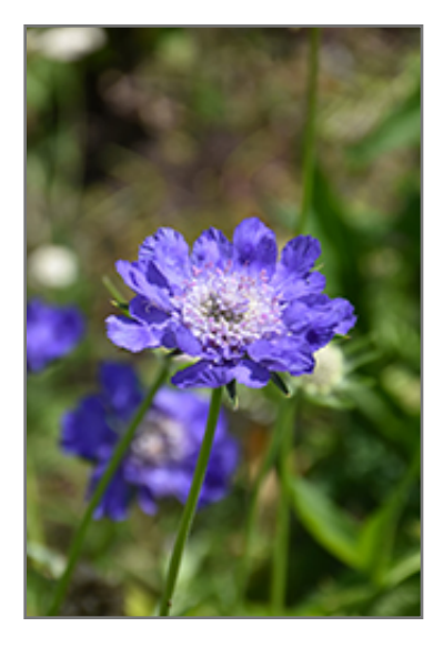
Fama Deep Blue Pincushion Flower flowers

Plant Height: 10 inches Flower Height: 20 inches Spread: 24 inches Spacing: 20 inches Sunlight: O Hardiness Zone: 4a Other Names: Scabious Group/Class: Fama Series