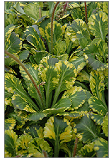
Golden London Pride foliage