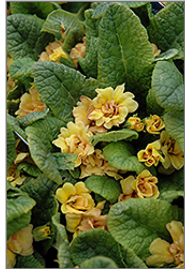
Sunshine Susie Primrose flowers