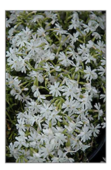
Snowflake Phlox flowers

This variety produces a showy carpet of bright white flowers shining in the spring sun; prune lightly after flowering to encourage a dense growth habit; wonderful for rock gardens, edging, or in mixed containers