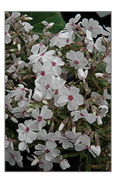
Amazing Grace Moss Phlox flowers

This variety produces a showy display of bright white flowers with golden centers surrounded by maroon-pink spots; prune lightly after flowering to encourage a dense growth habit; wonderful for rock gardens, edging, or in mixed containers