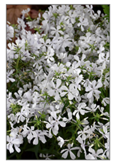
May Breeze Phlox flowers

A lovely variety with starry, pale powder-blue, fragrant flowers that bloom in mid-spring to early summer; a wonderful plant for borders and edging; not prone to mildew, and grows best in slightly dry conditions