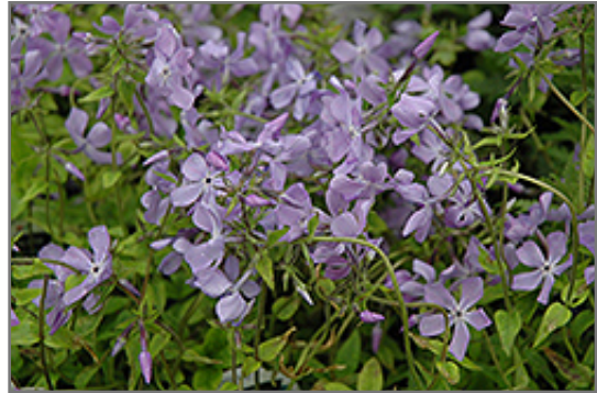
London Grove Blue Phlox flowers