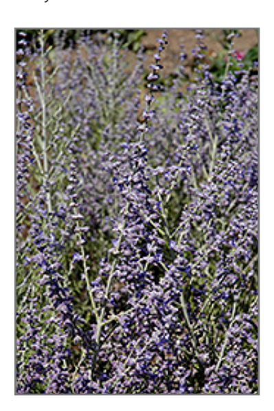
Peek-A-Blue Russian Sage flowers

Peek-A-Blue Russian Sage is recommended for the following landscape applications;