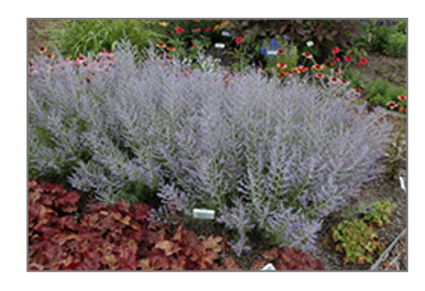
Peek-A-Blue Russian Sage in bloom

This is a relatively low maintenance plant, and is best cut back to the ground in late winter before active growth resumes. It is a good choice for attracting butterflies to your yard, but is not particularly attractive to deer who tend to leave it alone in favor of tastier treats. It has no significant negative characteristics.