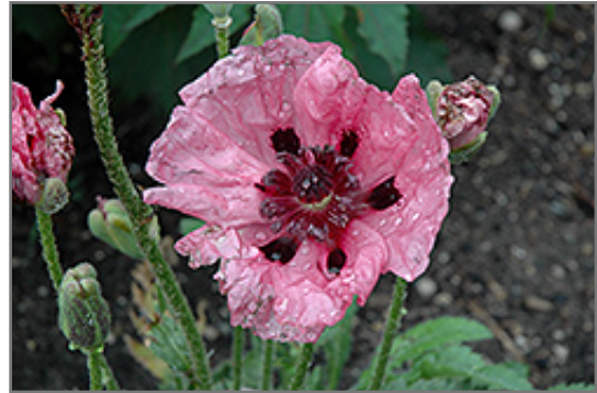
Plum Pudding Poppy flowers