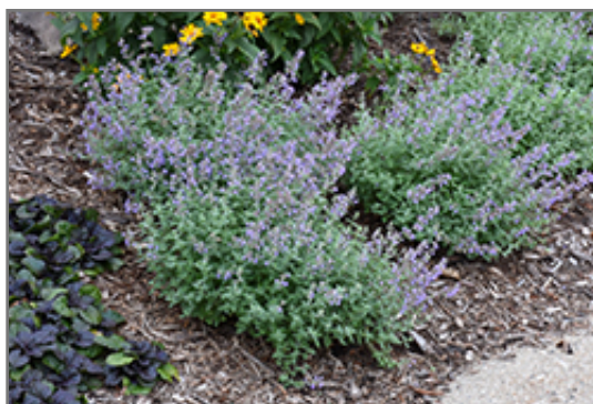
Purrsian Blue Catmint in bloom