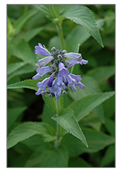
Cool Cat Catmint flowers

Cool Cat Catmint has masses of beautiful spikes of lightly-scented lavender trumpet-shaped flowers with blue overtones rising above the foliage from early to mid summer, which are most effective when planted in groupings. Its attractive fragrant pointy leaves remain dark green in colour throughout the season.