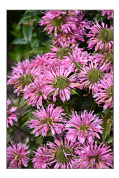
Pardon My Pink Beebalm flowers