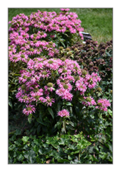
Pardon My Pink Beebalm in bloom