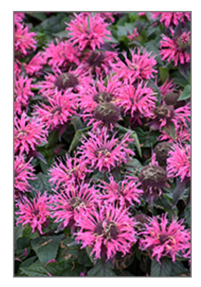
Bubblegum Blast Beebalm flowers