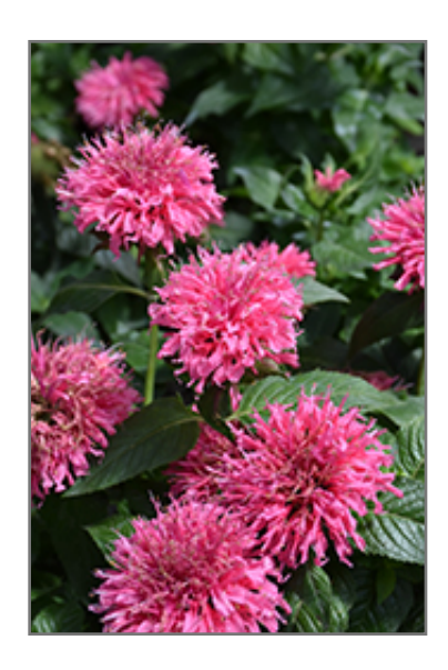
Bubblegum Blast Beebalm flowers