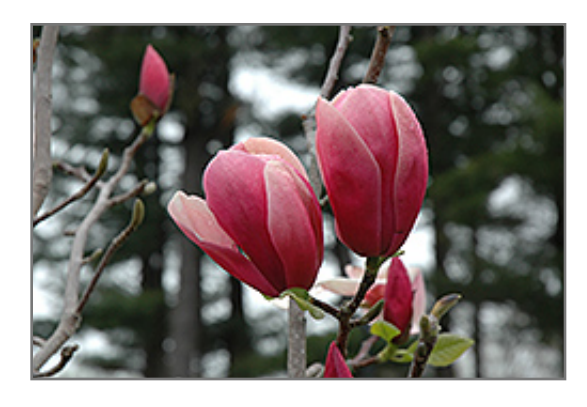
Rose Marie Magnolia flowers