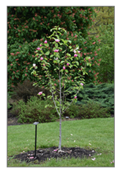
Rose Marie Magnolia in bloom