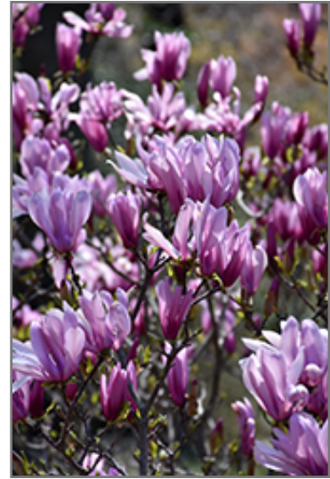
Judy Magnolia flowers

This tree does best in full sun to partial shade. It requires an evenly moist well-drained soil for optimal growth, but will die in standing water. It is not particular as to soil type, but has a definite preference for acidic soils. It is quite intolerant of urban pollution, therefore inner city or urban streetside plantings are best avoided. Consider applying a thick mulch around the root zone in winter to protect it in exposed locations or colder microclimates. This particular variety is an interspecific hybrid.