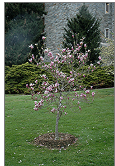
Judy Magnolia in bloom