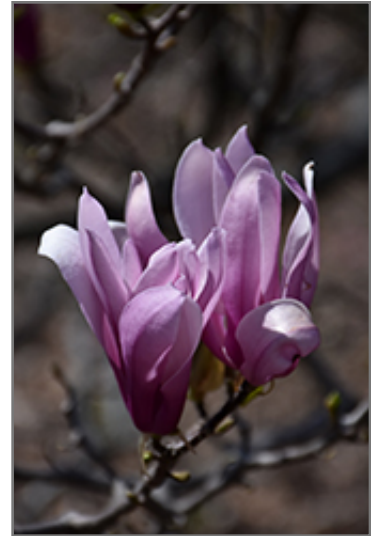
Judy Magnolia flowers