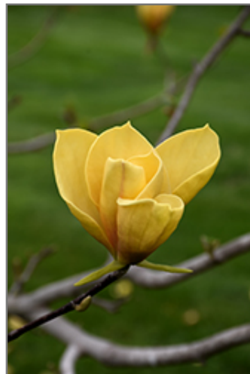
Judy Zuk Magnolia flowers