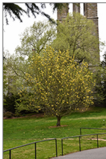
Judy Zuk Magnolia in bloom