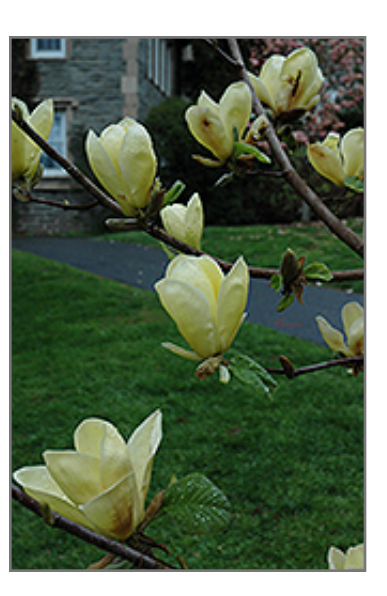
Golden Sun Magnolia flowers