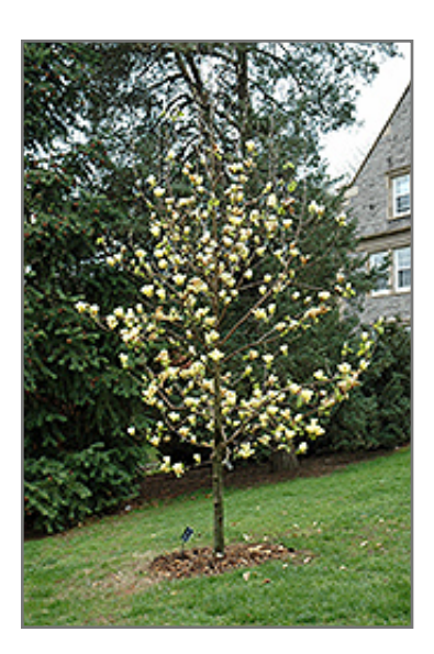
Golden Sun Magnolia in bloom