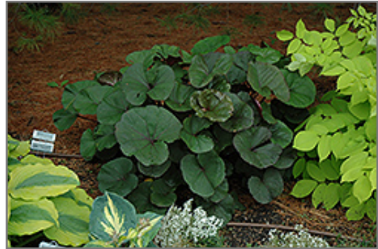
Midnight Lady Rayflower