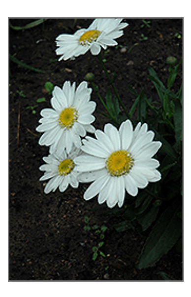
Highland White Dream Shasta Daisy flowers

An outstanding shasta daisy producing stunning, large semi-double white blooms with golden centers and drooping white rays; multiple blooms per stem; a beautiful addition to the garden when massed; blooms throughout the summer