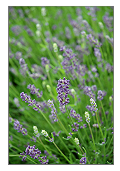
Essence Purple Lavender flowers

Essence Purple Lavender is recommended for the following landscape applications;