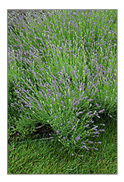
Essence Purple Lavender in bloom