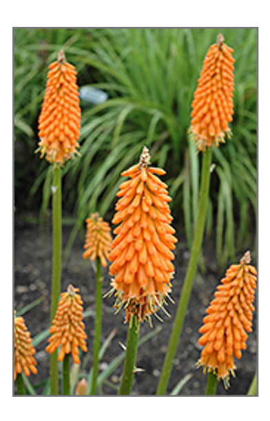
First Sunrise Torchlily flowers

Stunningly bright orange flowers on this early blooming, compact variety create a brilliant border or container planting; makes a great cutflower and attracts hummingbirds