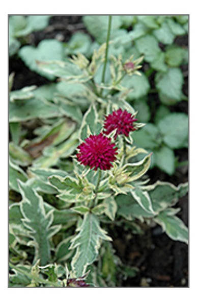
Thunder and Lightning Scabious flowers

Thunder and Lightning Scabious is recommended for the following landscape applications;