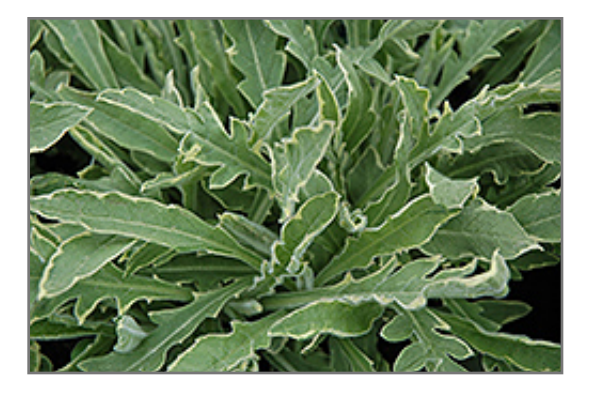
Thunder and Lightning Scabious foliage