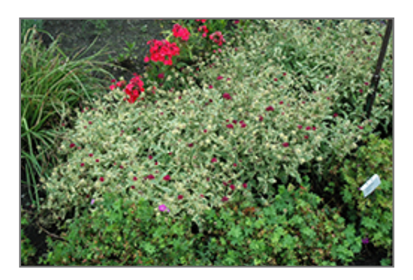
Thunder and Lightning Scabious in bloom

Thunder and Lightning Scabious will grow to be about 14 inches tall at maturity, with a spread of 20 inches. It tends to be leggy, with a typical clearance of 1 foot from the ground, and should be underplanted with lower-growing perennials. It grows at a fast rate, and under ideal conditions can be expected to live for approximately 3 years. As an herbaceous perennial, this plant will usually die back to the crown each winter, and will regrow from the base each spring. Be careful not to disturb the crown in late winter when it may not be readily seen!