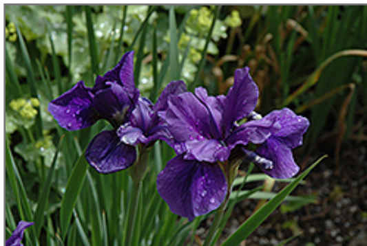
Pirate Prince Siberian Iris flowers