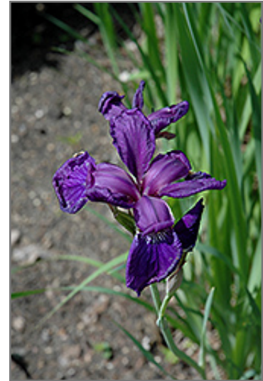
Maranatha Siberian Iris flowers