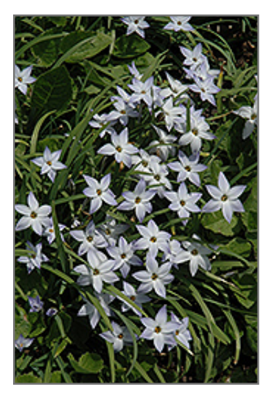
Wisley Blue Spring Starflower flowers

Beautiful blue, star shaped flowers that are sweetly fragrant in early to mid-spring; grass-like foliage smells like garlic when crushed; a pest resistant variety, great for edging, containers and beds