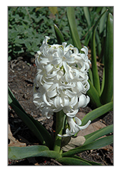
White Pearl Hyacinth flowers

Fragrant, luminous white flowers in spring cover this lovely perennial; plant among perennials and under leggy shrubs to get an early start on the growing season